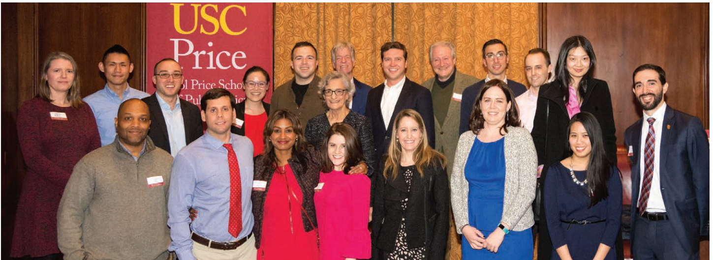
USC featured MetroFreight partners during a March 13 event in New York City.